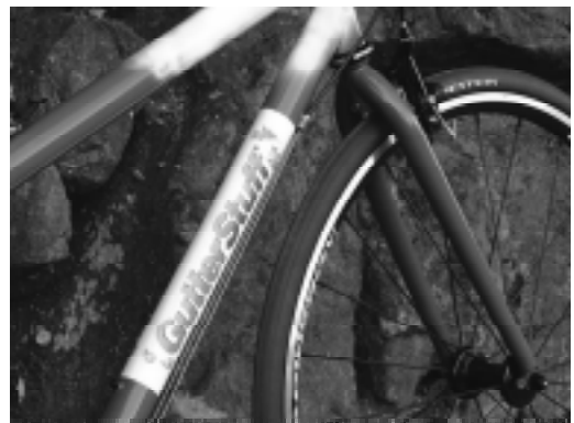
GutterStuff has a new company tandem