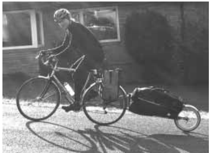
Me, commuting on a sunny winter day last November. Notice I'm smiling even though I'm pulling over 100 pounds up the hill. That's what comfort can do for you;-)

I guess the moral of the story is: Treat your commuter as your prized possession, and it'll keep you wanting to ride all year. There's no reason to think of it as a throw away bike.