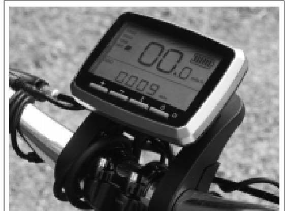
Control panel mounts on handle bars.