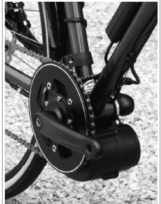
Motor mounts cleanly underneath bottom bracket.