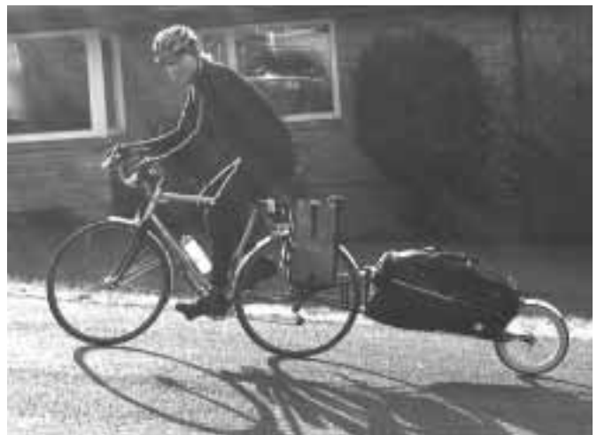
Me, commuting on a sunny winter day in November. Notice I'm smiling even though I'm pulling over 100 pounds up the hill. That's what comfort can do for you;-)

I guess the moral of the story is: Treat your commuter as your prized possession, and it'll keep you wanting to ride all year. There's no reason to think of it as a throw away bike.