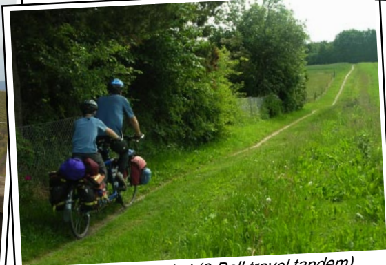
The Trickle Nickel (8-Ball travel tandem) visits Denmark