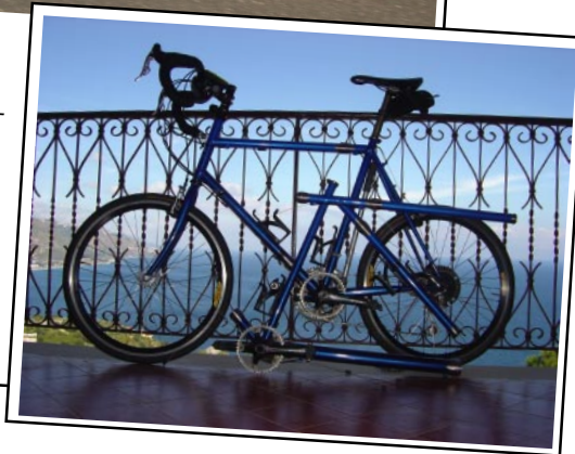
Right: The Gohman's tandem in its single status. Read more in our online scrapbook at www.rodcycle.com